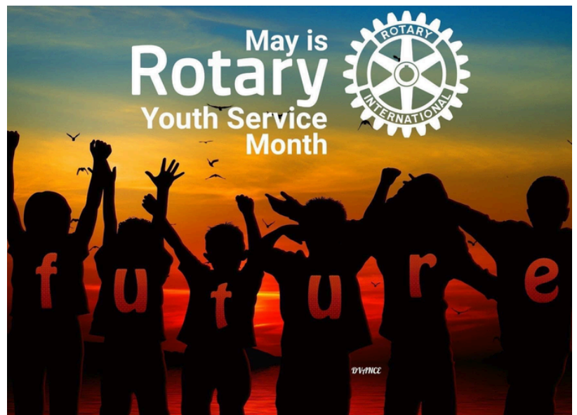
May is recognized as Youth Service Month in Rotary, celebrating the importance of engaging and supporting youth as future leaders of communities and the world.