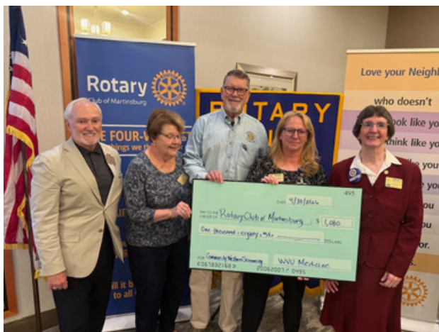
Volunteers from the WVU Wellness Screening.