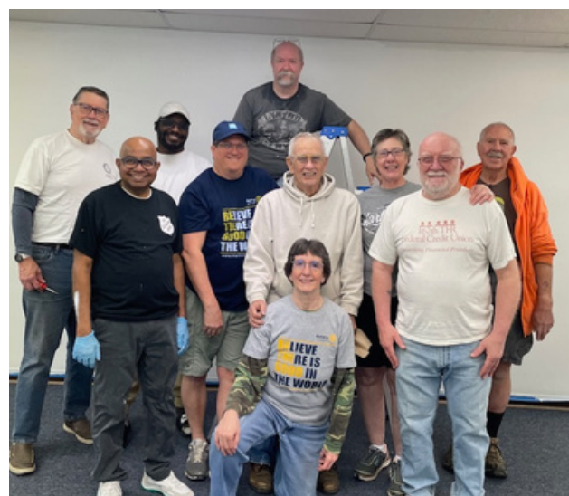
Rotary members come together to paint Salvation Army building in Martinsburg.